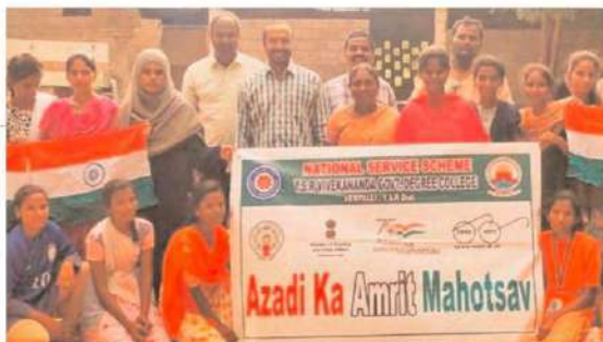
వివేకానంద డిగ్రీ కళాశాలలో మహిళలకు క్రీడా పోటీలు