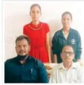
ఎంపికైన విద్యార్థులతో ప్రిన్సిపల్, ఫిజికల్ డైరెక్టర్